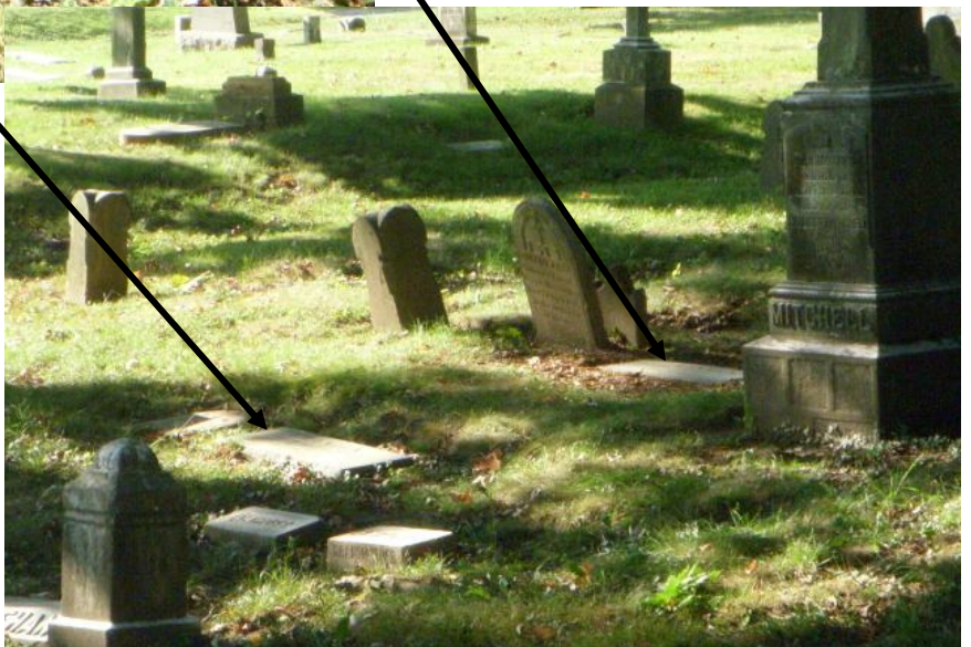
MANION & Coyle