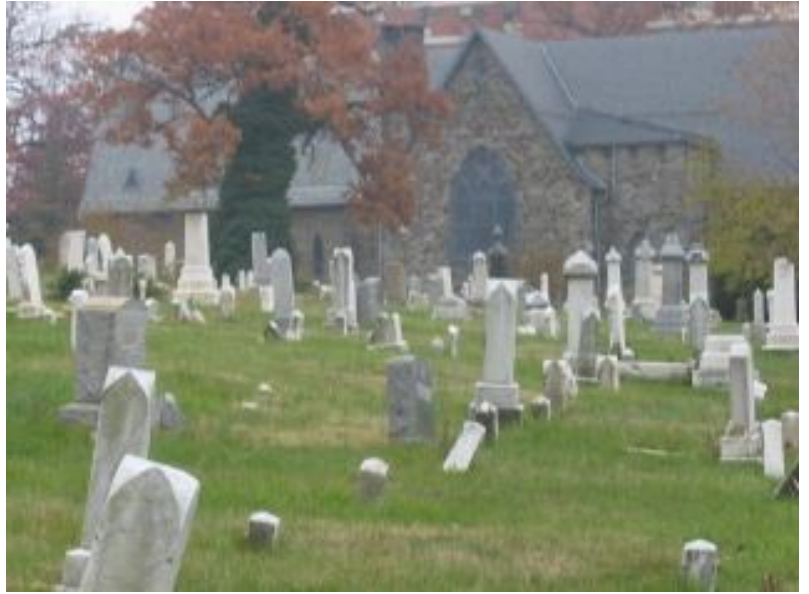
St. Mary’s Church on Roland Ave. in Hampden is no longer active. The building is used as a community center.

The Kone/Manion monument can be seen from W. 41 st Street in Hampden, Baltimore (in background)