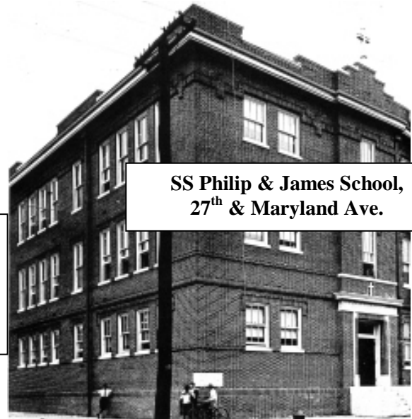
SS Philip & James School, 27 th & Maryland Ave.