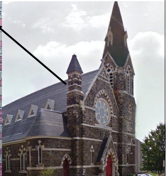
Parish Records at St. Ann's Church, Baltimore, MD